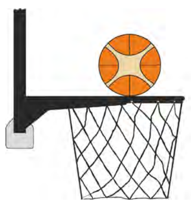
Diagram 2 Ball in contact with the ring

31-15 Statement. Interference is committed by a defensive or offensive player during a shot for a field goal when a player touches the basket or the backboard while the ball is in contact with the ring and still has a possibility to enter the basket.